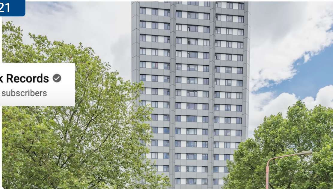
The Grenfell Tower fire (Disaster Documentary)