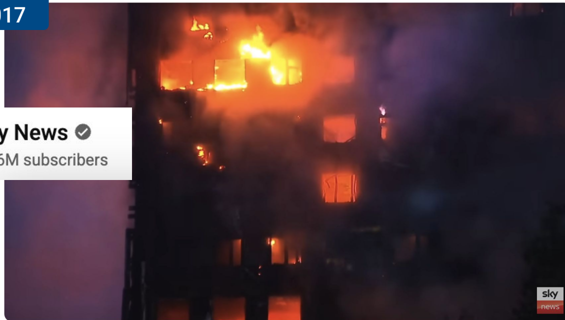
Grenfell: The Fire of London